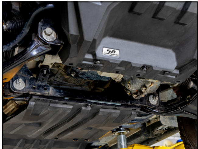
Image shows centre piece removed for oil change.

Made up from three individual parts, the UVA is designed for serviceability. Each piece has been designed so that it can be removed easily to allow individual access to different parts of the vehicle for servicing.