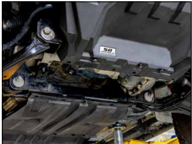
Image shows centre piece removed for oil change.

Made up from three individual parts, the UVA is designed for serviceability. Each piece has been designed so that it can be removed easily to allow individual access to different parts of the vehicle for servicing.